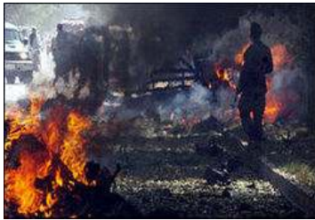
Indian Embassy in Kabul

On July 7, 2008, a bomb exploded at the Indian embassy in Kabul, Afghanistan, killing over 50 people, and injuring over 100 others. The Afghan government and the Indian intelligence agency immediately blamed the ISI, in collaboration with the Taliban and Al-Qaeda, of planning and executing the attack. Reports on the bombing suggested that the aim was to "increase the distrust between Pakistan and Afghanistan and undermine Pakistan's relations with India, despite recent signs that a peace process between Islamabad and New Delhi was making some headway."