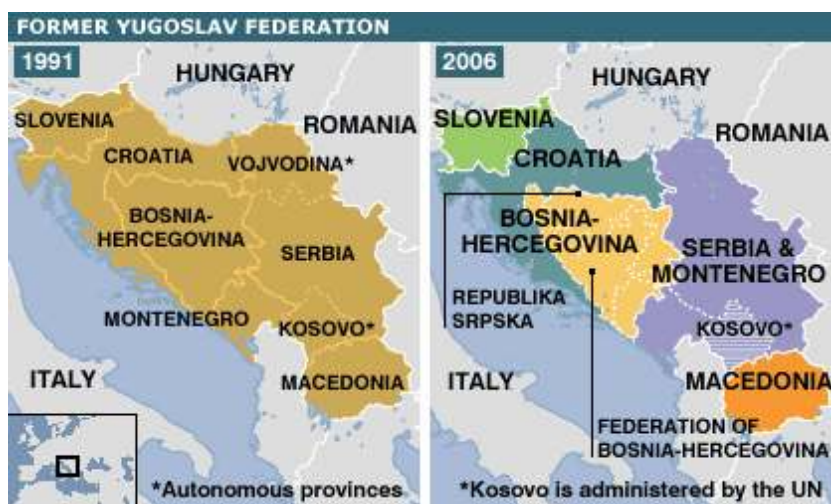
Yugoslavia - Before and After Balkanization

In 1992, with the start of the Bosnian War, Al-Qaeda-affiliated terrorists began operating with the ethnic Bosnian Muslim minority in fighting the Serbs. In turn, these Al-Qaeda affiliated groups were supported with training, arming, and finances by German, Turkish, Iranian and US intelligence agencies; with additional financial support from Saudi Arabia. In 1997, the Kosovo War began, in which the militant-terrorist-drug trafficking Kosovo Liberation Army (KLA) began fighting against Serbia, with training, arms and financial support from the US and other NATO countries. The CIA, German intelligence, the DIA, MI6 and British Special Forces (SAS) all provided training and support to the KLA.