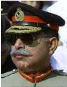
ISI Chief Lt.-General Mahmoud Ahmad

A week prior to the 9/11 attacks, the head of Pakistan's ISI was on a visit to Washington, D.C., where he met with several key policy figures, such as Deputy Secretary of State, Richard Armitage; Senator Joseph Biden, who is going to be Obama's Vice President; and with his counterparts in the CIA and Pentagon, and several other officials. He was in Washington right up to and after the 9/11 attacks, and was engaged in several key consultations with US officials, pledging support for the US War on Terror instantly. However, the very same Chief of the ISI also happened to have previously approved of wiring $100,000 to the lead 9/11 hijacker, Mohammed Atta, which was also confirmed by the FBI. Thus, the ISI suddenly became a financier of the 9/11 attacks. Yet, no action was taken against the ISI or Pakistan, apart from the ISI Chief being fired upon this revelation making it into the media.